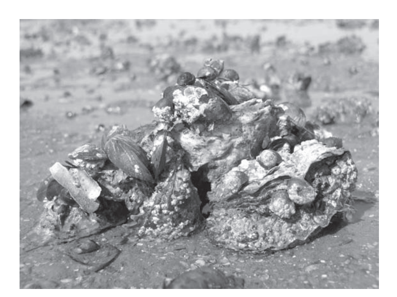
Figure 3: The race is still open: blue mussels settling on top of Pacific oysters.

which is mainly a cause of cold winters leading to severe mortality and thereby forcing major drawbacks in population development (Thieltges et al., 2004). In the last decade slipper limpets were not much constrained by cold winters and thus strongly increased and maximum values of 300 to 400 specimen/m2 were recorded on blue mussel beds in the Lister Deep and locally it forms dense single-species layers.