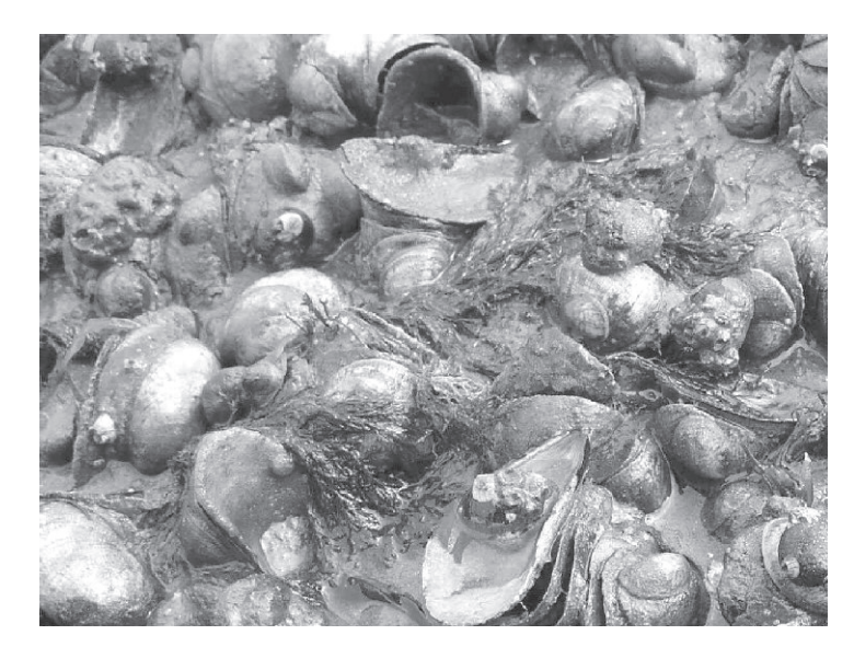
Figure 2: Dense assemblages of slipper limpets cover a blue mussel bed in the Lister Deep

blue mussel bed area are not compensated by spatfall, so annual losses accumulate and lead to a permanent decrease.